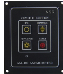
AM-100R REMOTE BUTTON