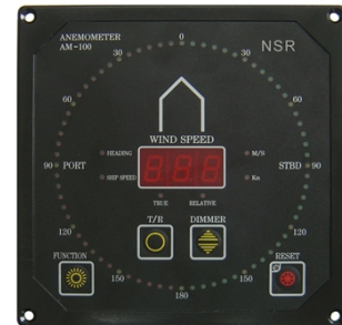
AM-100D DISPLAY UNIT